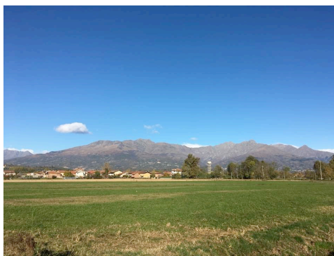
A view of the Biellese Plain

The exchange will be held in Verrone and the neighboring villages (Benna, Borriana, Candelo, Cerrione) and the key theme will be non-formal education related to principles underlying communication, journalism and the media.