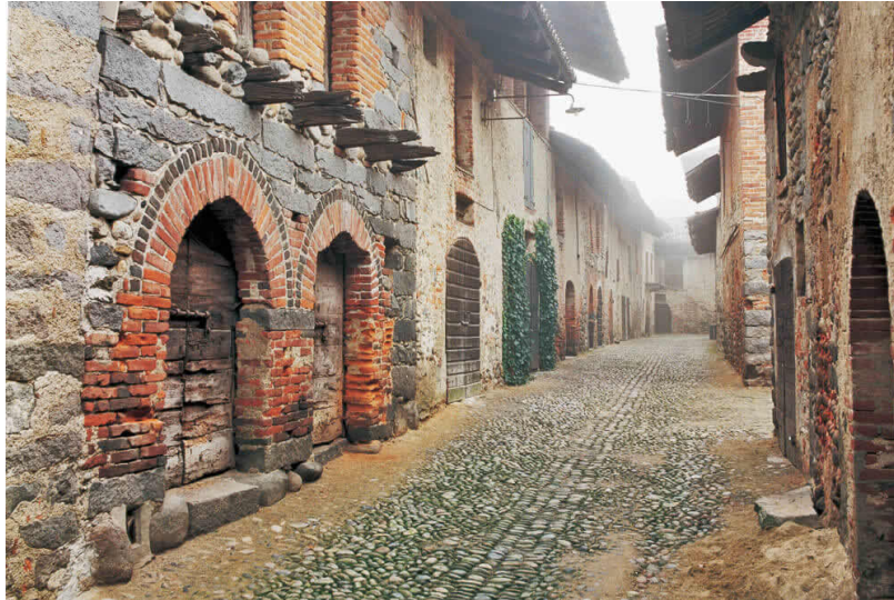
A lane ("rua") in the Ricetto in Candelo