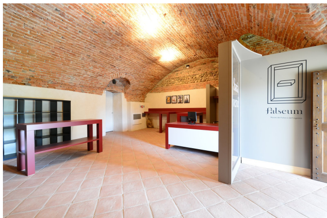
Pictures of the Castello di Verrone and the entrance of the Museum Falseum, where the activities will take place

This Info pack contains all the important and necessary information about the Youth Exchange, we kindly ask you to read it with attention. Thank you!